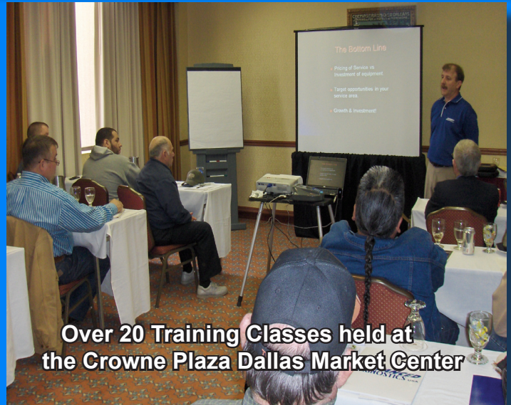
Over 20 Training Classes held at the Crowne Plaza Dallas Market Center