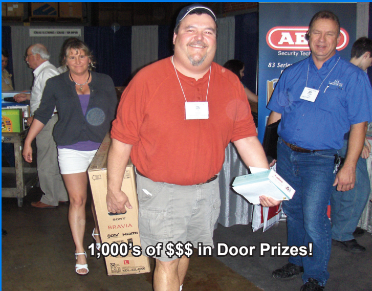
1,000's of $$$ in Door Prizes!