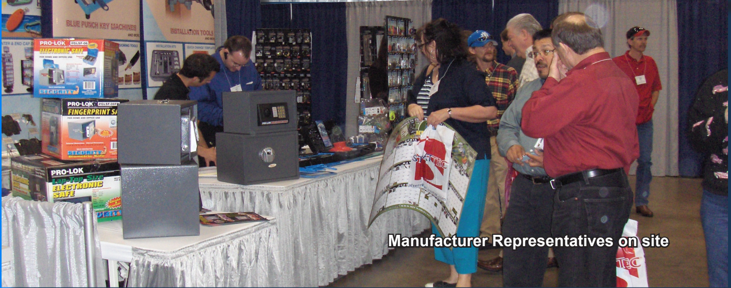
Manufacturer Representatives on site