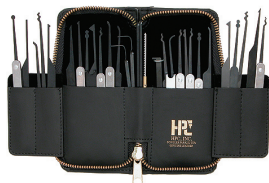
Class Only Door Prize! HPC NDPK-32 Pick Set